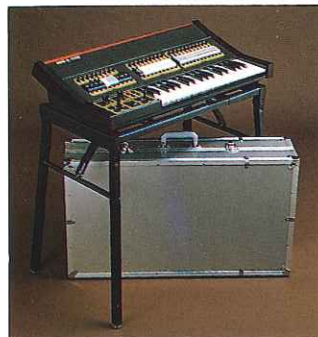
STAND/ST-1 CASE/HARD CASE

Perfect for on-stage use, this "performing synthesizer" has eleven instrument tabs and eight synthesizer tabs that let you mix together as many different sounds as you like. Above each tab switch is a control knob for adjusting the most important parameter of that sound. There's even quarter-tone capability—when you press two adjacent keys, you get the pitch in-between! The ring modulator provides chimes and other metallic timbres. Instrument and synthesizer sounds can be routed to different speaker systems to take maximum advantage of this synthesizer's tonal versatility.