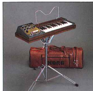
STAND/STAND for M-500SP CASE/SOFT CASE

(INSTRUMENT), Quarter Tone, Multiple Trigger, Key Hold ●CONTROLS (x 3): Keyboard Sensor, Joy Stick (INSTRUMENT), Joy Stick (SYNTHSE) «CONTROL SECTION», ●JOY STICK (LEFT): Pitch Bend, Vibrato Depth, Noise Modulation Depth ●JOY STICK (RIGHT): LPF Cut-off Frequency (SYNTHSE), HPF Cut-off Frequency (SYNTHSE) ●KEYBOARD SENSOR CONTROL SWITCHES x 2: Pitch Bend Up/Vibrato Depth/Pitch Bend Down, INSTRUMENT/INSTRUMENT + SYNTHSE/SYNTHSE ●BALANCE: SYNTHSE/INSTRUMENT ●TOTAL TUNE: \pm 200 Cents ●SYNTHSE PITCH: \pm 700 Cents ●PORTAMENTO: MOMENTARY SWITCH ●POWER & VOLUME «INPUT & OUTPUTS SECTION», ●SIGNAL OUTPUTS: Mix/Synthe (5 Vp-p MAX), Headphones Output ●KEYBOARD OUTPUTS: CV Output (Hz/V, 0 V~8 V), TRIG Output ( \square ) ●CONTROL INPUTS: VCO CV Input (Hz/V), EG TRIG Input ( \square ), VCO FM Input (OCT/V, -3 V~+3 V), Synthe VCF fcM Input (2 OCT/V, -5 V~+5 V) ●DIMENSIONS: 774 (W) x 173 (H) x 400 (D) mm ●WEIGHT: 11 kg ●ACCESSORIES: Connection Cord x 1, Dust Cover x 1 ●POWER CONSUMPTION: Voltage (Local Voltage, 50/60 Hz), Wattage (17 W)